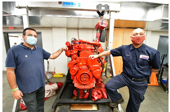
Bus mechanics from TWU Local 260

Transit vehicle mechanics will also be impacted by the implementation of new technologies. However, because autonomous buses will continue to require maintenance, repair, and upkeep, the number of mechanic jobs eliminated is likely be much lower than the number of operator jobs. And while some of their responsibilities will remain the same – for example, replacing worn tires and brake pads – mechanics will need to learn new skills so that they are equipped to maintain the array of sensors and other devices comprising the new autonomous vehicle systems. This will require a significant investment in workforce development, upskilling, well beyond the level of spending today.