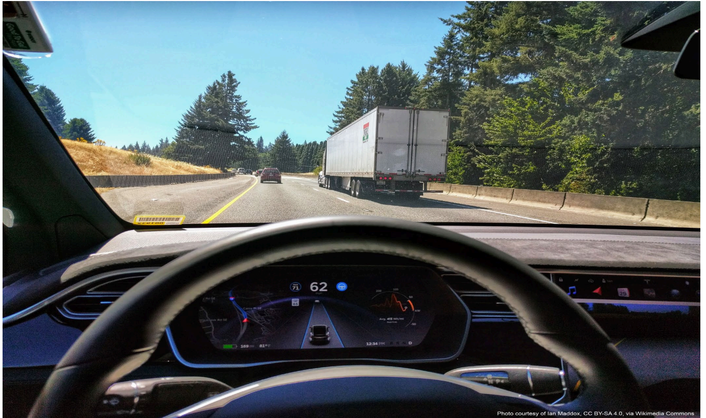
A Tesla Model X engaged in autopilot mode, controlling distance from lead car and centering vehicle in lane

While AV technology is attracting the attention of municipal leaders, transit agencies, and the media, truly autonomous transportation is decades away. Driver-assist technology, or ADAS, on the other hand, is available and is currently being utilized in many localities. These more tried and true solutions have been incorporated into private vehicles and are being implemented by some transit agencies to help advance transportation safety and efficiency. And, as the name suggests, this technology is intended to work with – rather than displace – vehicle operators.